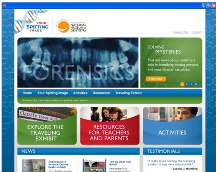
Your Spitting Image Microsite