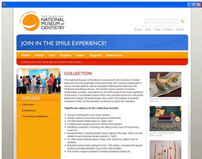
Museum Collection Page