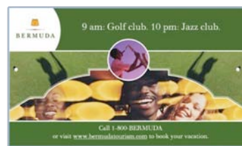
Email & Newsletter