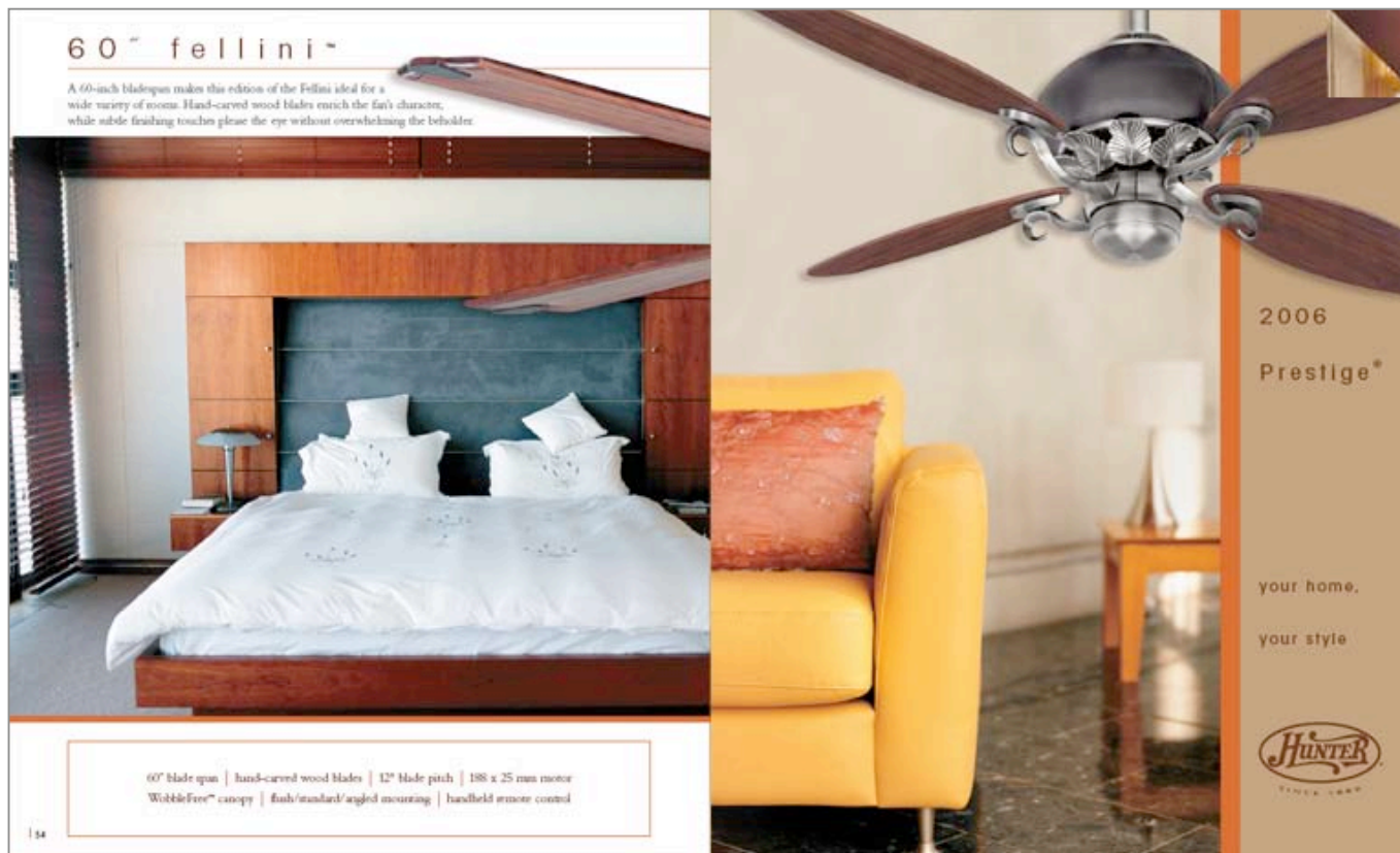
INTERACTIVE FLASH-BASED VIRTUAL CATALOG